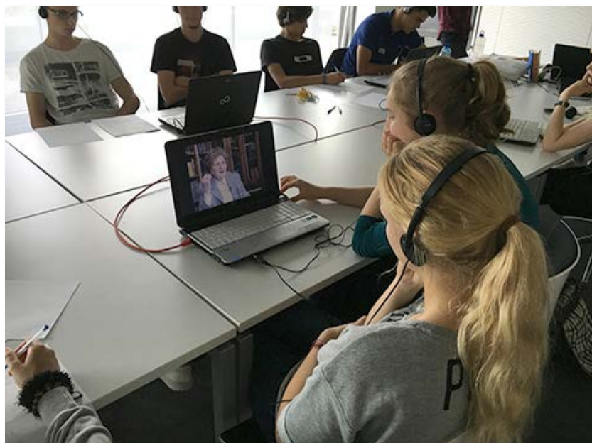
Watching Interviews – Jewish Self-Help in the Warsaw Ghetto; CeDiS, FU Berlin 2016

but their narratives form a counterpoint to the photographs: Key questions, which are prominent in the video testimonies, play no role at all in the photographs: the causes of hunger, the murders, the course of events and their consequences up to the present day.